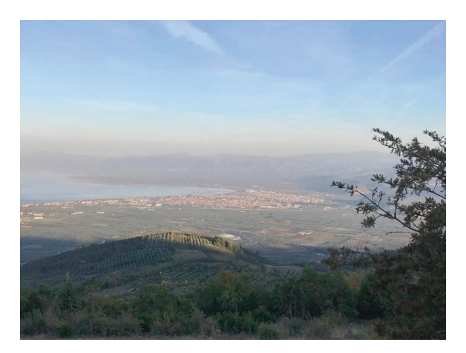
Fig. 3.3 Nicaea and its plain

In this light, it is important to notice that another impressive urban circuit of walls endowed the city Nicaea (see Fig. 3.3) which became a thematic capital when the Opsikion was reduced in the 760 s (Treadgold 1997, 406). Although repeatedly hit by Arab raids, Nicaea never fell to the Arabs. It was from Nicaea that the strategós commanded a network of outer defensive strongholds, including Doryleum and Kotayon (Foss 2003, 252, Angold 2003b, 27). The Late Antique five-kilometer-long